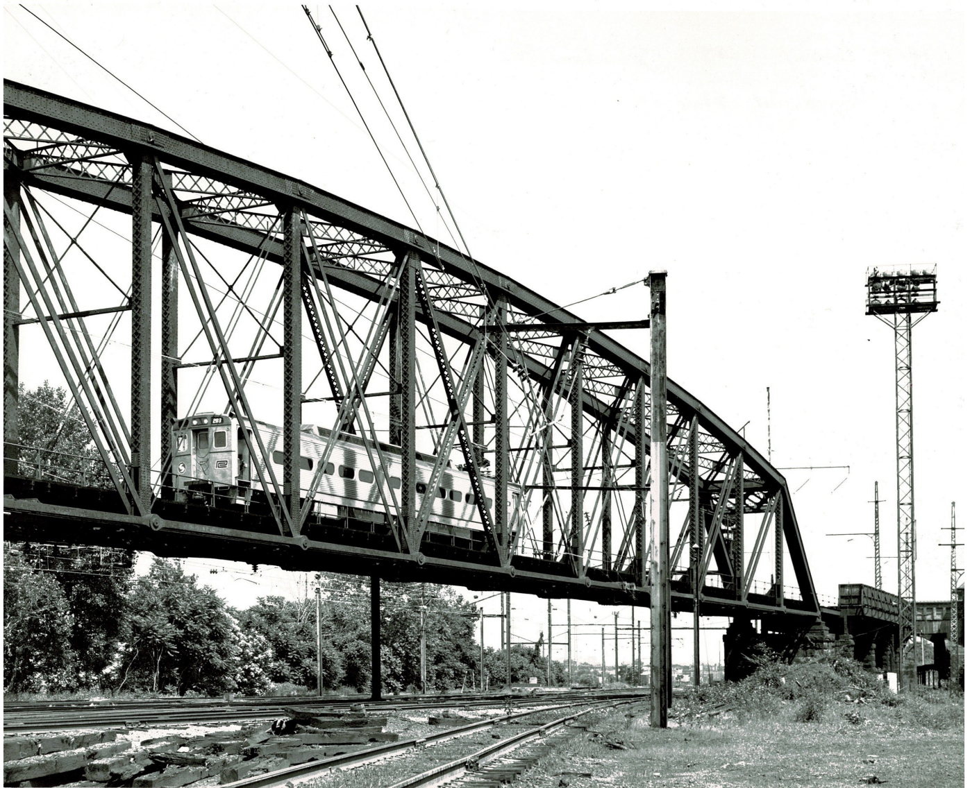
Above: SEPTA Conrail Silverliner IV Manayunk - Philadelphia crossing the Schuylkill Branch Bridge at 52nd St. June 23, 1978.