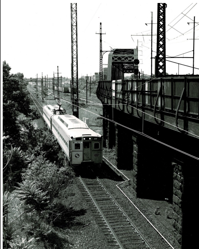
SEPTA / Conrail Paoli Local at 52nd Street, June 23, 1978