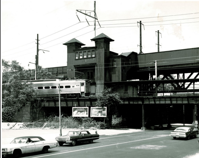
Conrail MU Manayunk to Philadelphia at 52nd Street Station on June 23, 1978. The station was burned by vandals in 1980 and torn down in 1995.

In 1978, Conrail was operating the passenger trains in Philadelphia.