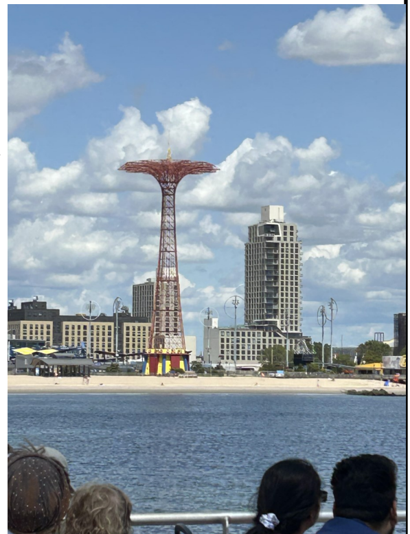
Above: The iconic Coney Island Parachute Jump