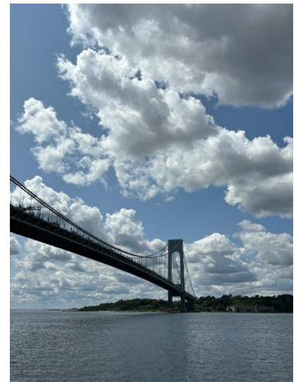
Verrazano Narrows Bridge