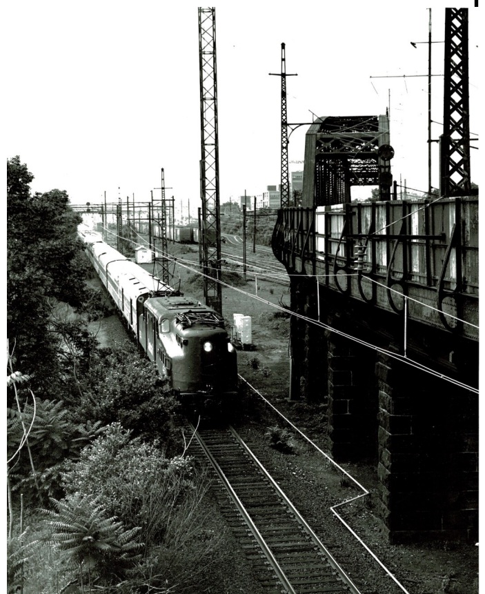
Amtrak Washington DC Section of the Broadway Limited at 52nd St. June 23, 1978.