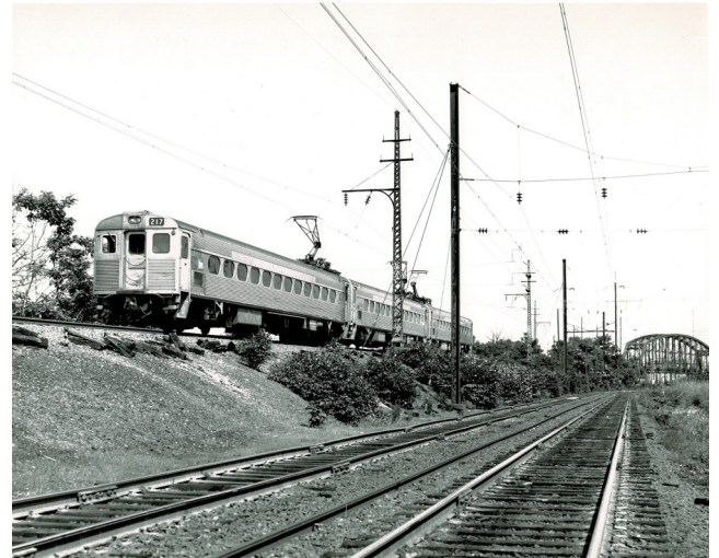
CR Paoli Local 52nd St. June 23, 1978