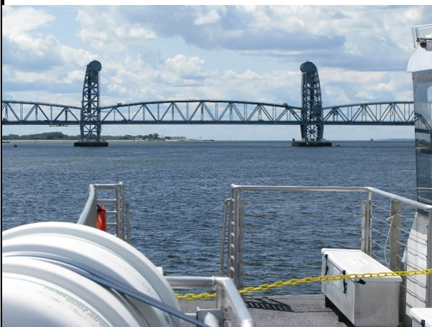
Left: The Marine Parkway Bridge in Jamaica Bay