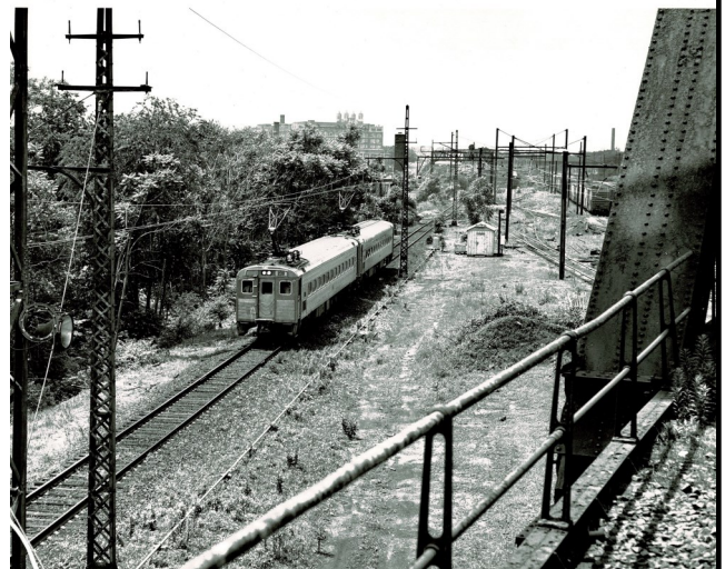
Right: A SEPTA Conrail-operated MU train to Manayunk local as seen from the top of the bridge on June 23, 1978.