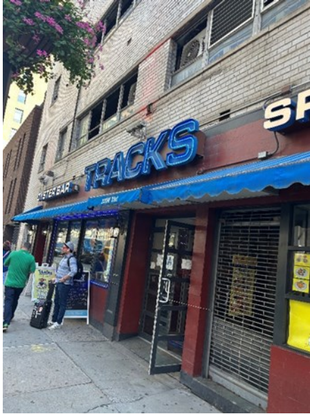
Tracks Restaurant - a Ride With Me Steve tradition

We hiked to Wall Street Subway station and took the next northbound train to Penn Station. Here we noticed a sign that said where our favorite (and train themed restaurant), “Tracks” was planning to reopen by this spring. Currently it is located at 31 st Street next to Madison Square Garden while the Long Island Railroad Terminal at Penn Station is being remodeled. Coming up to street level at 32 nd Street, the group strolled over to the “street Level” Tracks and all of us enjoyed fantastic food for an early dinner.