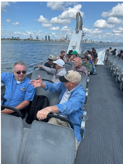
Our topside riders on the trip out to Rockaway