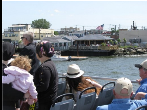
Left: Arriving at the Rockaway ferry dock

We re-boarded the same ferryboat for our return trip. Leaving the dock, our boat retraced the route on this much windier return trip, except we traveled on the west side of Governor’s Island which gave us better views of Brooklyn. After stopping at Sunset Park Ferry Terminal, we traversed the upper harbor to Pier 11. A nice two-hour voyage featuring a small jaunt into the Atlantic Ocean!