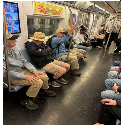
Riders on the #3 Subway

Our ferry stopped in Sunset Park, Brooklyn Army Terminal. Picking up a few passengers, we departed the dock and proceeded southward, then under the Verrazano Narrows Bridge. Soon we navigated past the final green buoy and into the Atlantic Ocean. The ocean was as smooth as glass! We cruised off the shore of Coney Island and Brighton Beach, as our Brooklyn born rider pointed out the various rides and sights. Within a few minutes the ferry entered Jamaica Bay with JFK International Airport on the far left in the distance. On the right riders noted the nice beaches on the bay at Breezy Point. Shortly, we arrived at the Rockaway Ferry Terminal and the town of Rockaway Beach.