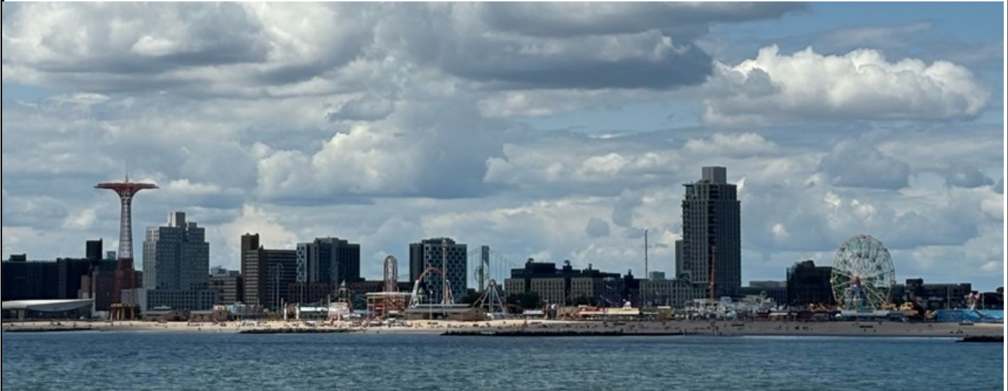
Above: The beach and rides at Coney Island

We re-boarded the same ferryboat for our return trip. Leaving the dock, our boat retraced the route on this much windier return trip, except we traveled on the west side of Governor’s Island which gave us better views of Brooklyn. After stopping at Sunset Park Ferry Terminal, we traversed the upper harbor to Pier 11. A nice two-hour voyage featuring a small jaunt into the Atlantic Ocean!