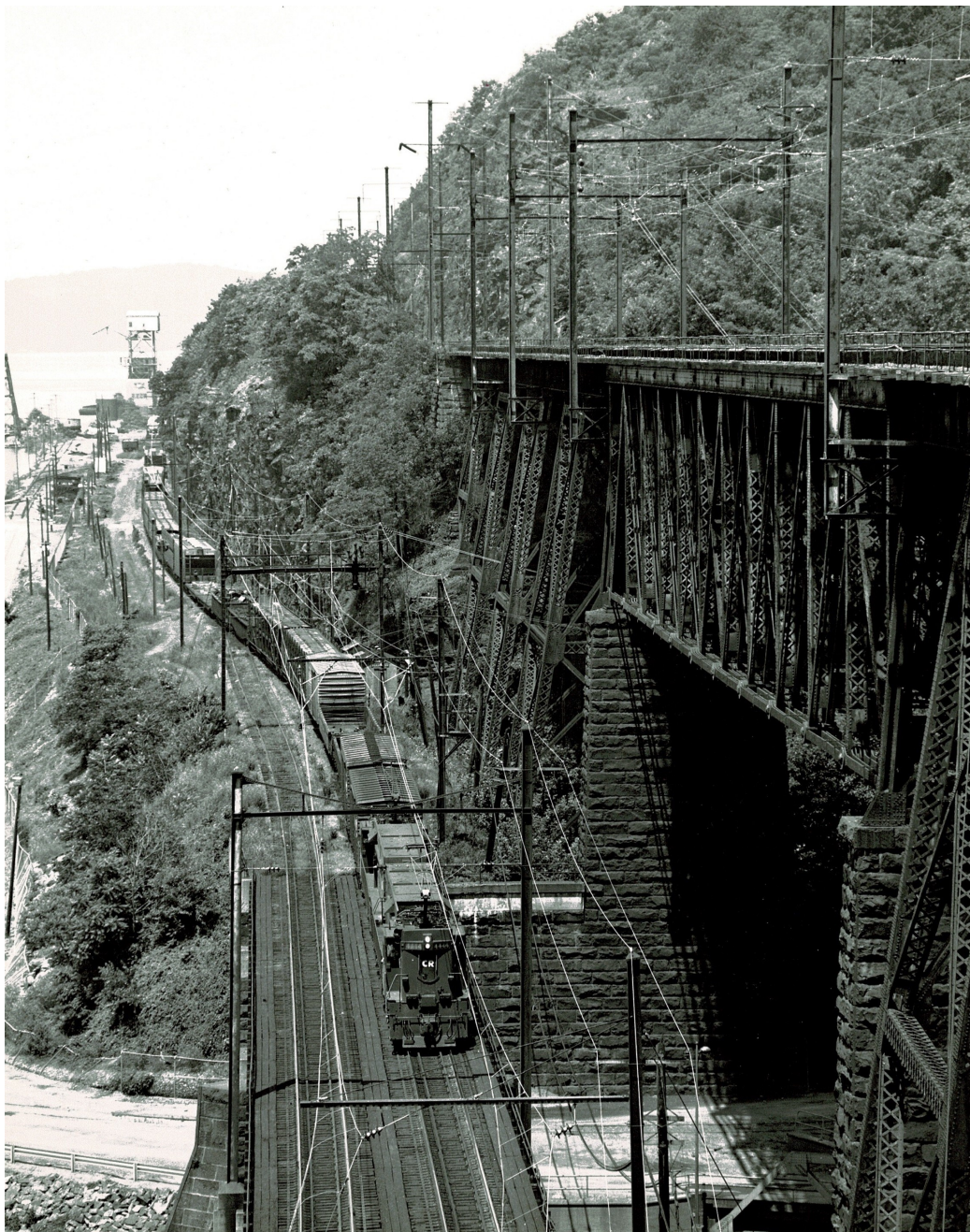
The iconic Safe Harbor during Penn Central era, June 24, 1978.