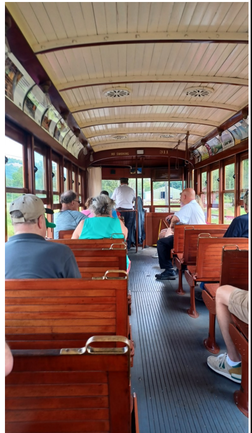
Above, inside Johnstown Traction # 311