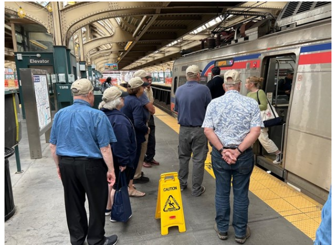
Above: Boarding our Silverliner V consist to Wilmington