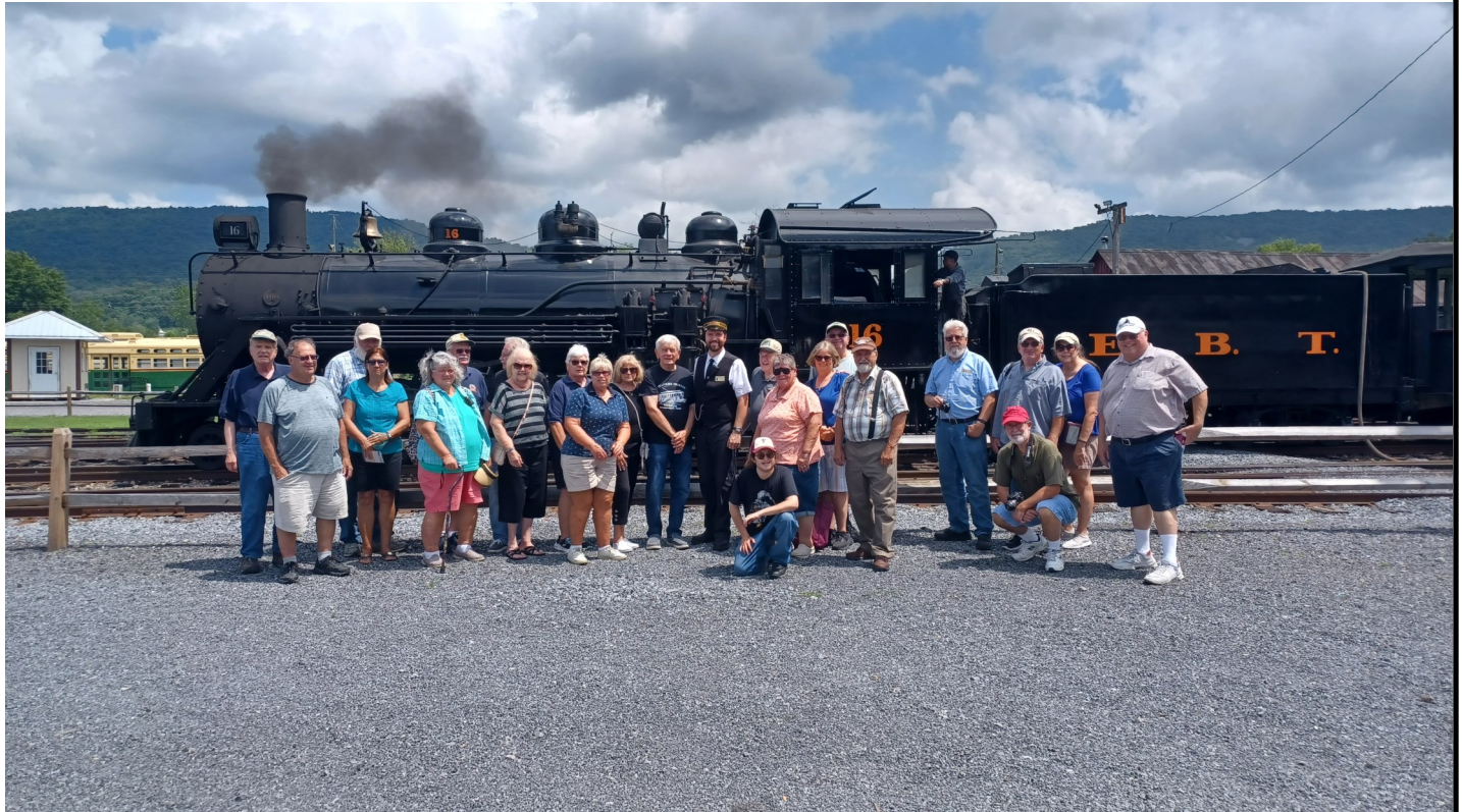
24 members of the Lancaster Chapter with our conductors at the East Broad Top, July 16, 2023

Saturday, August 12th, 9am clean-up day at the Christiana Freight Station. If so, could you add on clean up day to wear old paint clothes. We have lots of painting to do.