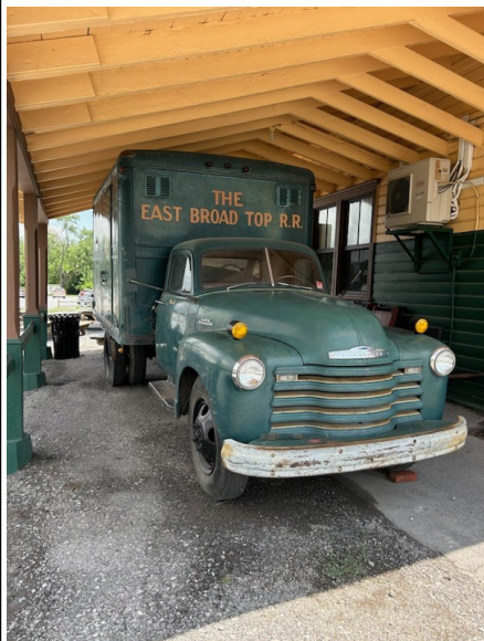
Left :EBT delivery truck Above: farm view from train Right: Engineer on # 16