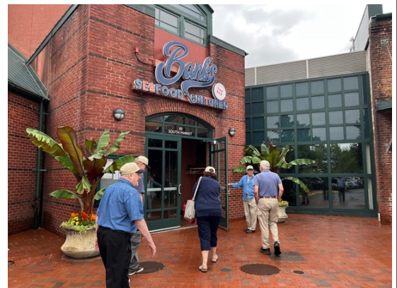
Above: Arriving at Banks Seafood