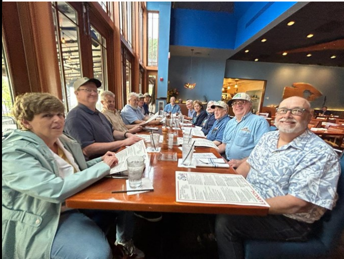
Above: The Group enjoying a meal at Banks