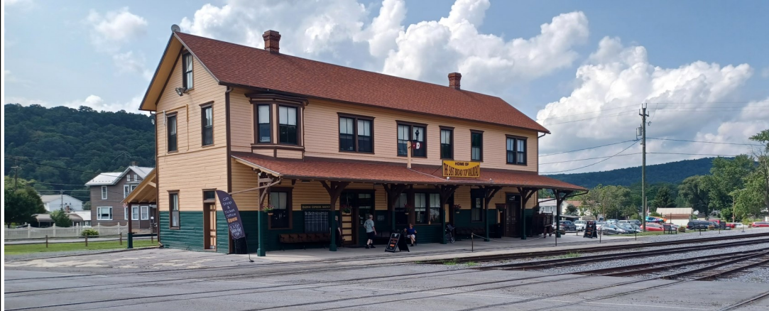
Left, EBT Rockhall Station