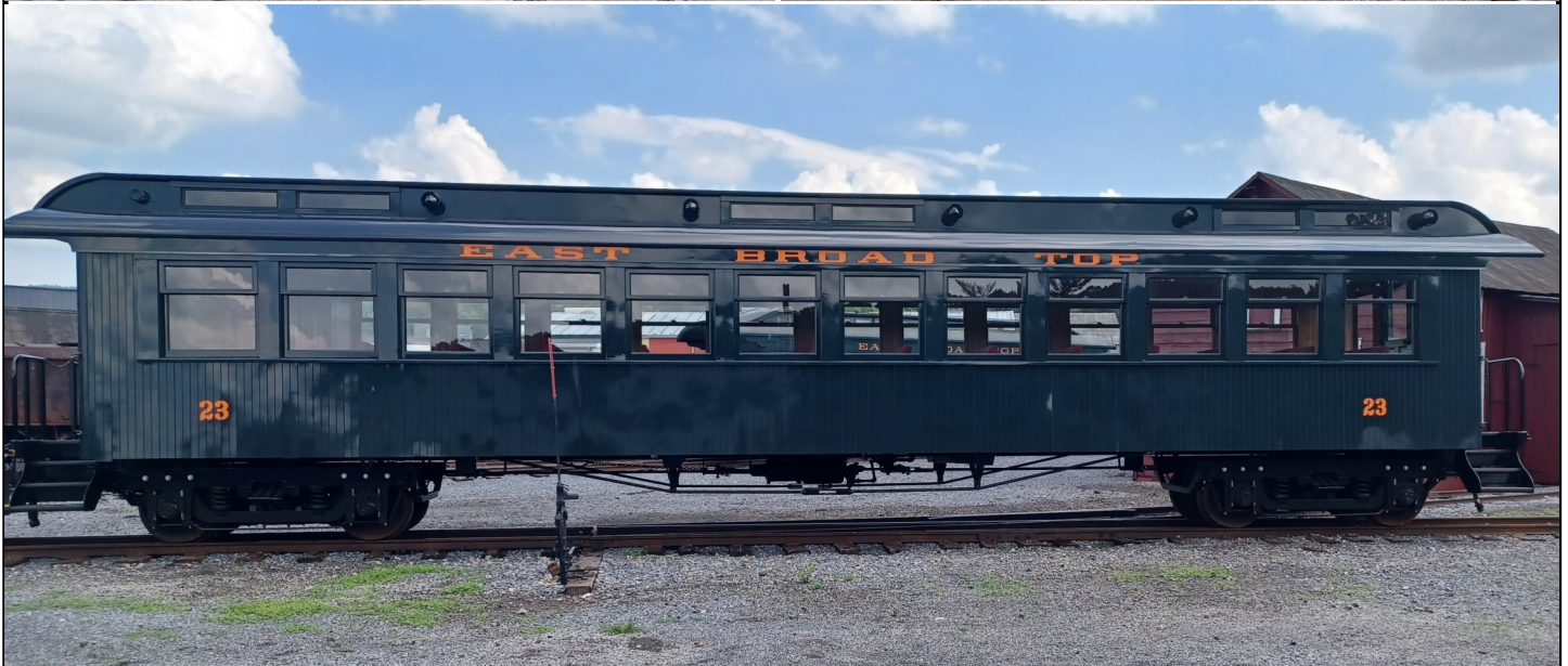
Above, locomotive # 16, caboose 28 and coach # 23.