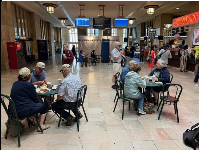
Above: Meeting for Breakfast at 30 th Street Station's food court

It was overcast with a light rain when we arrived at Wilmington at 11:32 AM. It was a short half-mile walk to Bank's Seafood where we all enjoyed fantastic seafood, served by Brooke, a very nice young woman. Brooke did a fantastic job serving all of us. We enjoyed appetizers, entrees, dessert and great conversation.