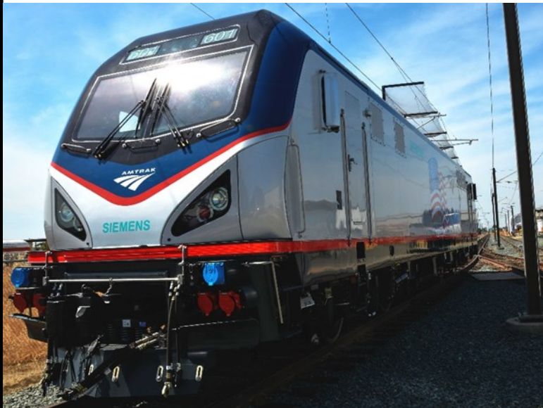
Left: Siemens ACL-42 "Charger" Diesel Locomotive