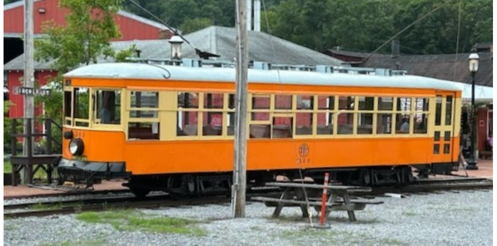
Above: Johnstown Traction Company # 311