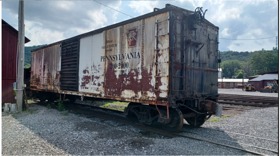
Below, PRR white box car