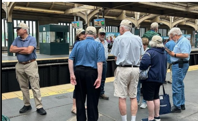
Above: Waiting for our Wilmington Train at 30 th Street, most wearing their Ride with Me Steve caps.